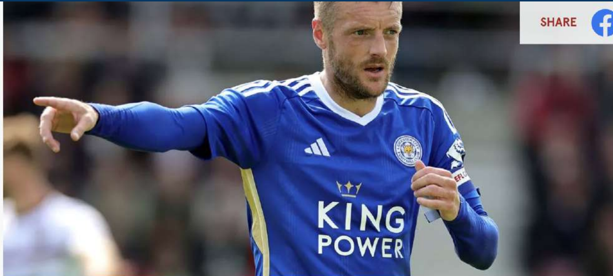
Leicester forward Jamie Vardy